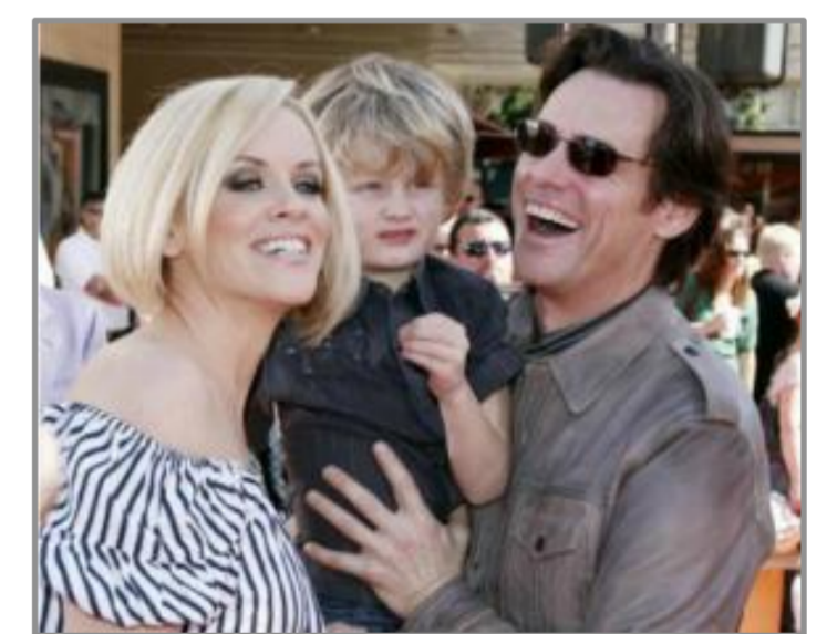
Media stars such as Jenny McCarthy and Jim Carrey have powerful opinions about vaccination.