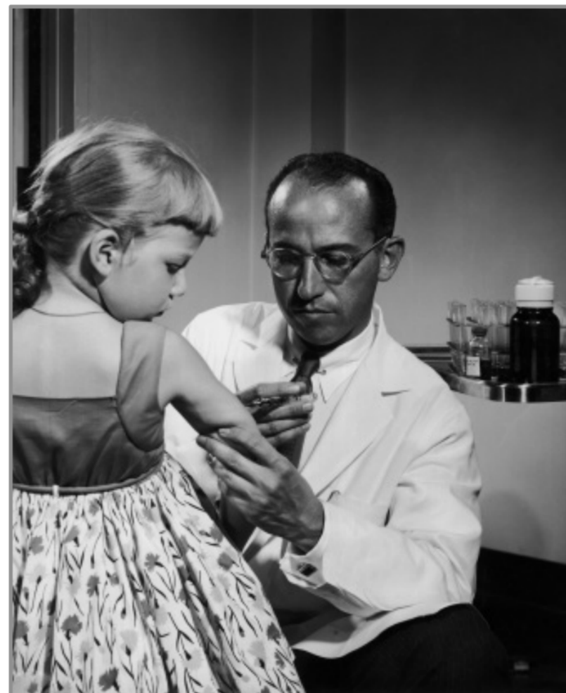
Jonas Salk, MD

Background/Introduction Identify means to reduce or eliminate vaccination injection fear or discomfort in an effort to avoid vaccine-preventable causes of stillbirth and damaged babies at birth. Methods Review and analyze relevant medical literature in English regarding vaccination practices and concerns during pregnancy. Results 1) Our review of current relevant American Congress of Obstetricians and Gynecologists (ACOG) publications showed no mention of vaccine injection pain and no means to prevent injection pain. 2) Recommendations supported by USPHS class I or II evidence include: a) medical providers can provide distractions at the time of injection; b) use of cold or vibration at skin site contralateral to the proposed injection site; c) inject the most painful shot last; and d) do not invoke “man up” imprecations or false reassurances. Conclusions 1) Evidence from non-reproductive medicine literature demonstrates effective means to reduce vaccination injection pain. 2) The listed United States Public Health Services (USPHS) recommended suggestions can be utilized without cost or difficulty in clinical reproductive care practices.