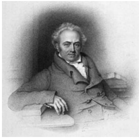
Sir Astley Cooper

1 Group B Strep International, 2 LA Best Babies Network, 3 Denver College of Nursing